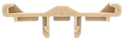
Group marker holder, Width: 6 mm, Material: PA6.6