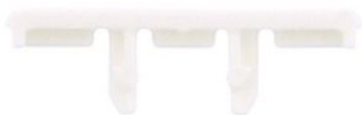
Group marker holder, Width: 6 mm, Material: PA6.6