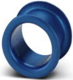
Adapter sleeve, nominal current: 20 A, color: blue

Please be informed that the data shown in this PDF Document is generated from our Online Catalog. Please find the complete data in the user's documentation. Our General Terms of Use for Downloads are valid ( http://phoenixcontact.com/download )