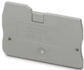
End cover, length: 53.5 mm, width: 2.2 mm, height: 39.3 mm, color: gray

Please be informed that the data shown in this PDF Document is generated from our Online Catalog. Please find the complete data in the user's documentation. Our General Terms of Use for Downloads are valid ( http://phoenixcontact.com/download )