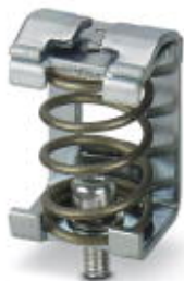
Shield connection terminal block, for applying the shield directly to the conductive mounting plates

Please be informed that the data shown in this PDF Document is generated from our Online Catalog. Please find the complete data in the user's documentation. Our General Terms of Use for Downloads are valid ( http://phoenixcontact.com/download )